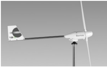
Aerogenerador minieólica Bornay Wind 13+

Wind + is the result of over 45 years of experience in the small wind industry, where Bornay has worked hard to innovate and to get a so far unknown result.