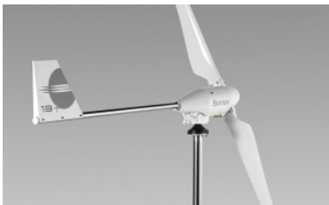
Aerogenerador minieólica Bornay Wind 13+