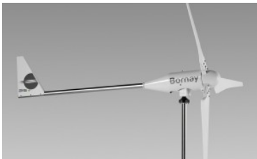
Aerogenerador minieólica Bornay Wind 25.3+